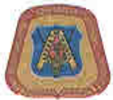
United Brotherhood of Carpenters & Joiners of America